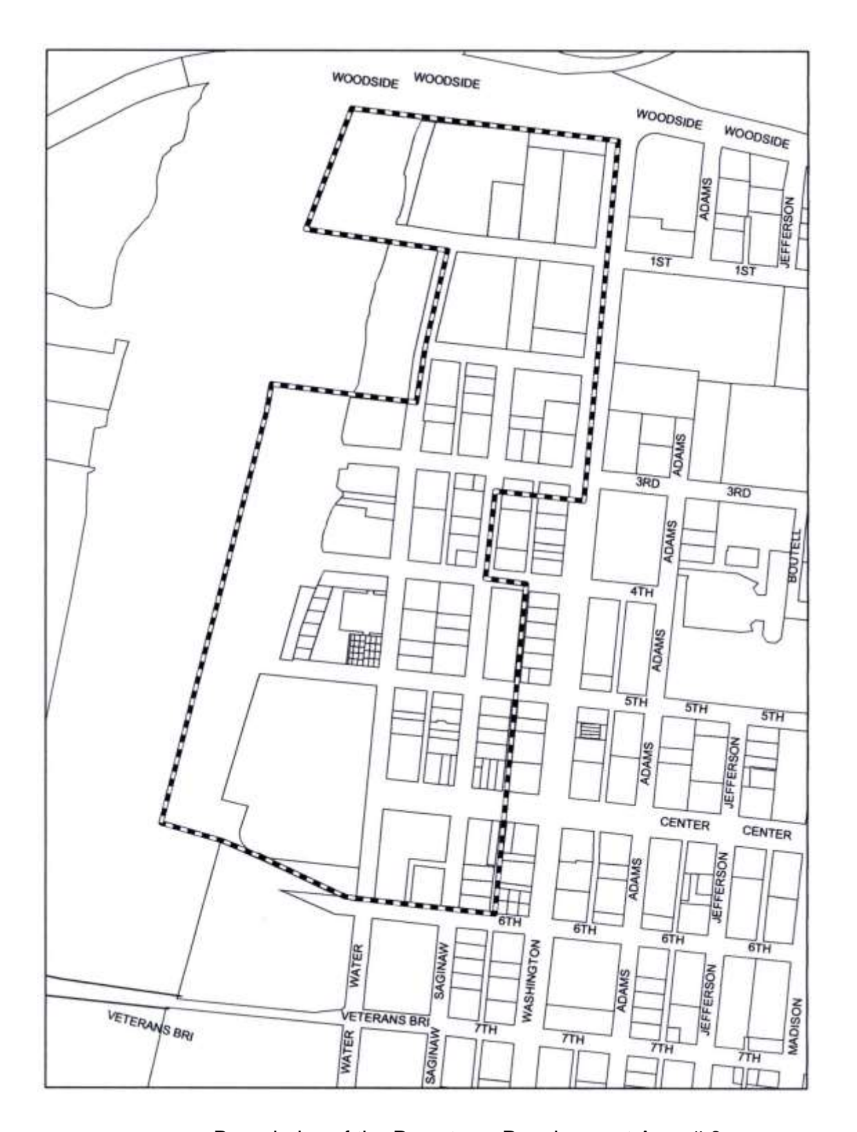
Boundaries of the Downtown Development Area # 6